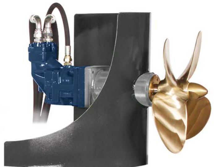
Hydraulic motor, pod and mounted propeller